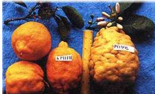
Fruits of the late lemon variety "Vakalou" in comparison to the Eureka Frost